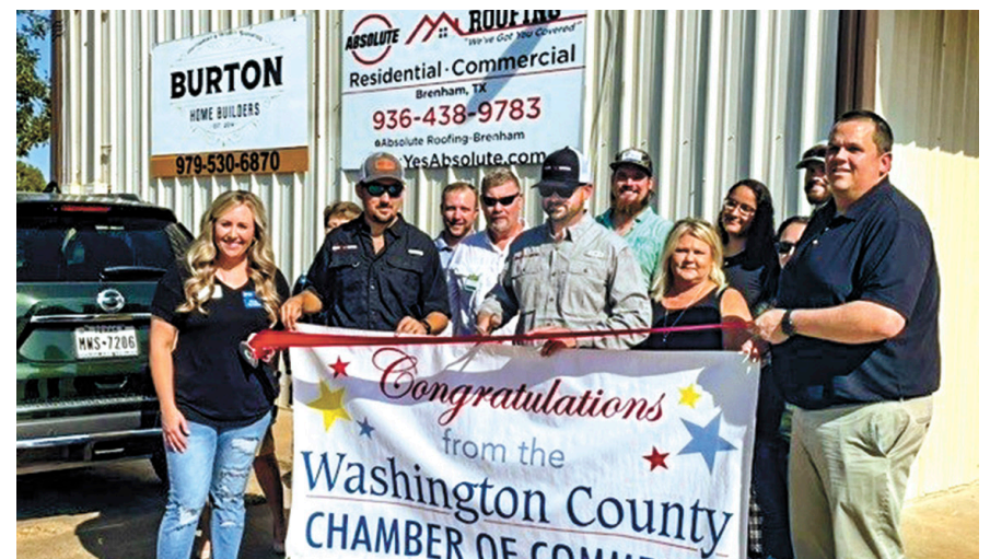
Absolute Roofing - Brenham

1117 Industrial Blvd, Brenham - Owner: Patrick Skweres