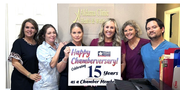
Aldama Clinic 15 Years

The Blue Blazers have begun celebrating our member's "Chamberversaries" by surprising them with Celebration Visits and thanking them for their investment.