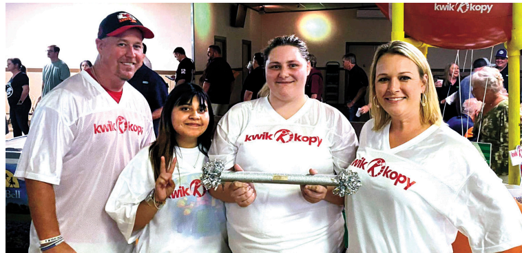
KWIK KOPY Business Center, Spirit Award Winner

The Chamber's 16th annual Tailgate fundraiser was hosted on August 24 at Silver Wings Ballroom. A huge crowd of over 600 people enjoyed a variety of tailgate food, plus cold drinks, Blue Bell ice cream and lots of mingling with colleagues and friends.