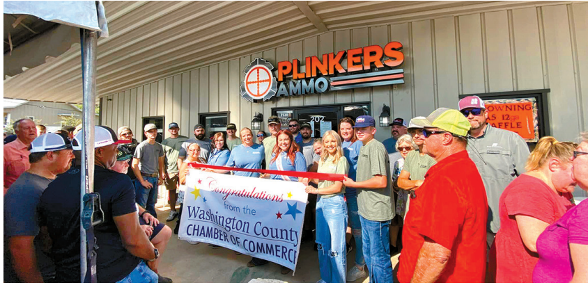
Plinkers Guns & Ammo