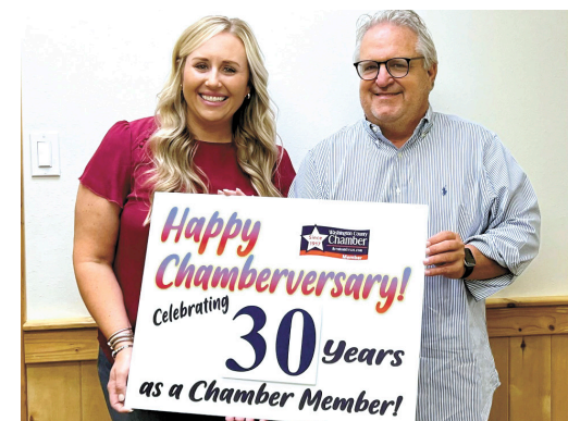
Chappell Hill Sausage 30 Years