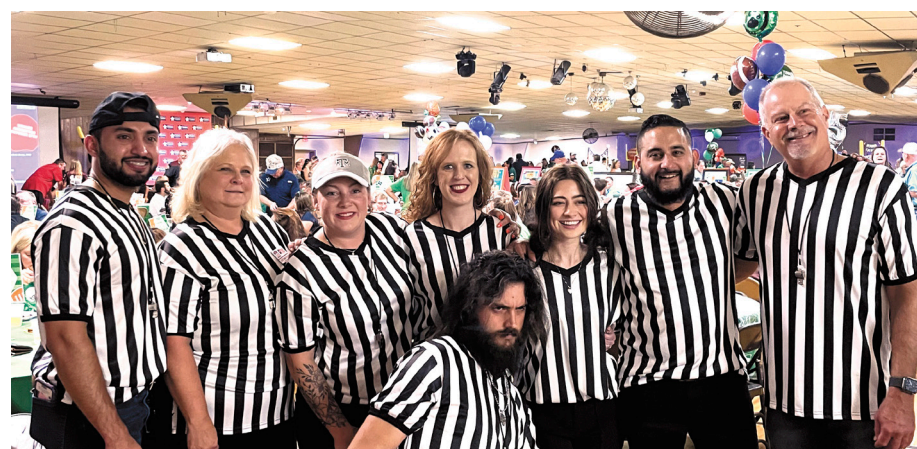
KWHI Team - 2023 Tailgate Pep Rally