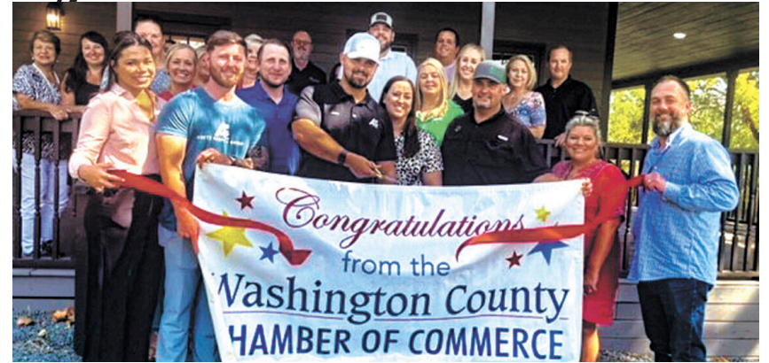
Arete Property Group, LLC