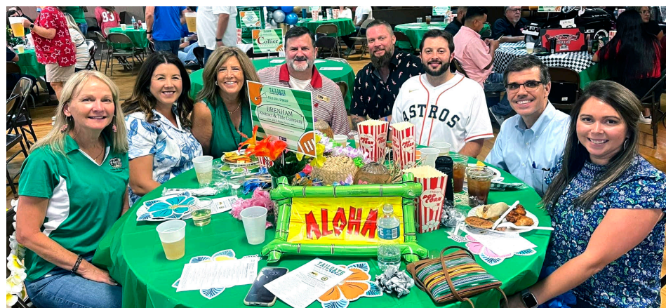
Brenham Abstract & Title Team, enjoying food, drinks, and camaraderie.