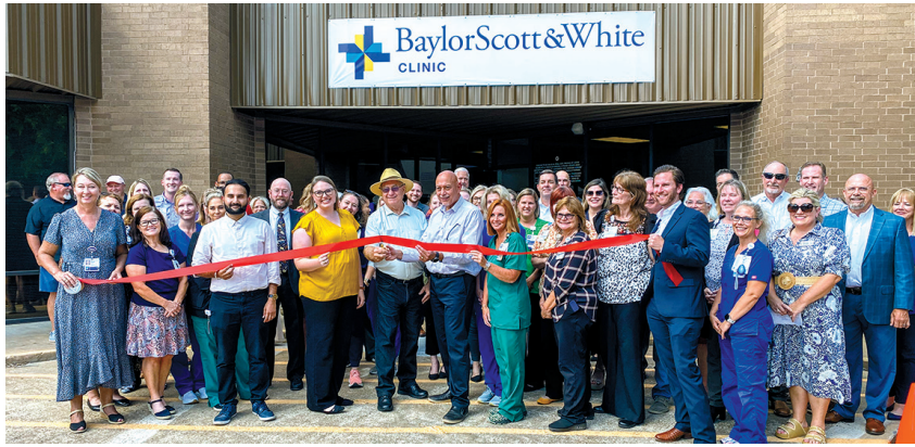
Baylor Scott & White Day Street Clinic 2111 S. Day Street Brenham